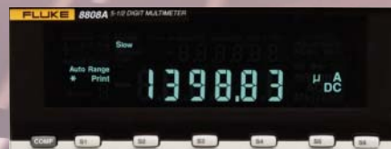
The 8808A can measure small leakage currents with a resolution of up to 100 nA, without loading the circuit under test.