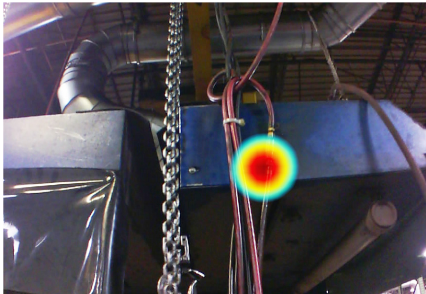
Images taken with the ii900 Sonic Industrial Imager in an industrial environment.

Fluke. Keeping your world up and running.®